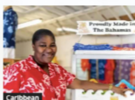
Caribbean Stuff Your Suitcase with This Traditional Bahamian Fabric