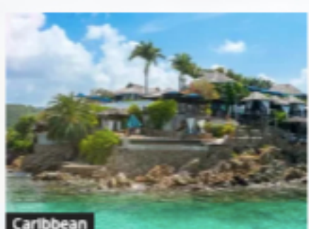
Caribbean Antigua and Barbuda: Two Islands, ONE Unforgettable Experience