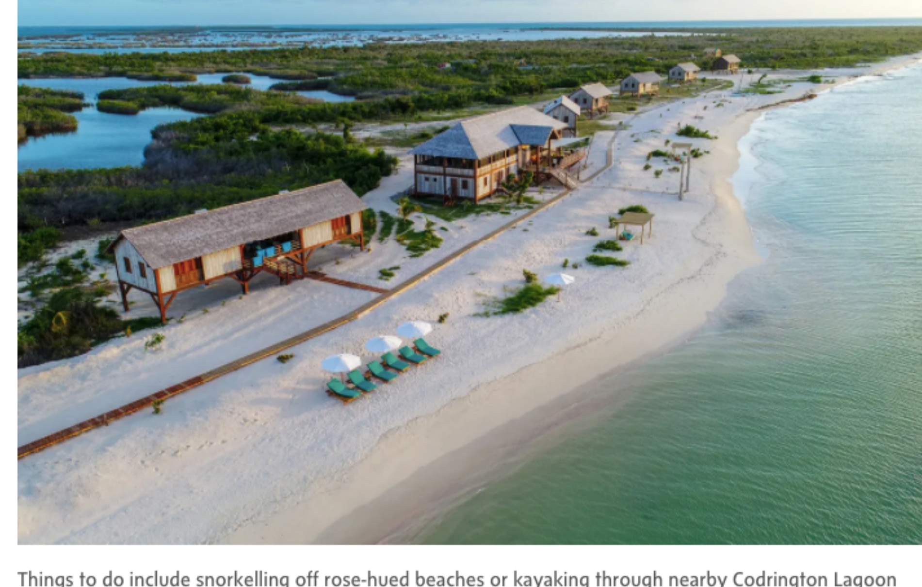
Things to do include snorkelling off rose-hued beaches or kayaking through nearby Codrington Lagoon National Park.