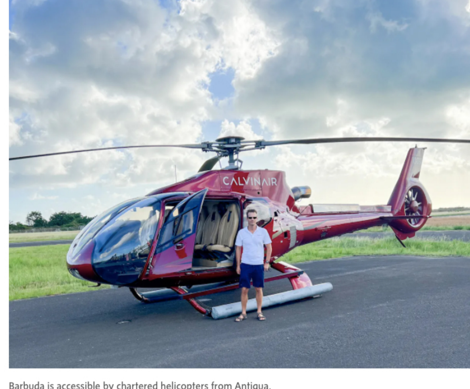
Barbuda is accessible by chartered helicopters from Antigua.

Barbuda is accessible by ferry, direct scheduled flights and helicopter charter from Antigua. While most popular as a day trip destination, it's also possible to overnight at a hotel, guest house or cottage.