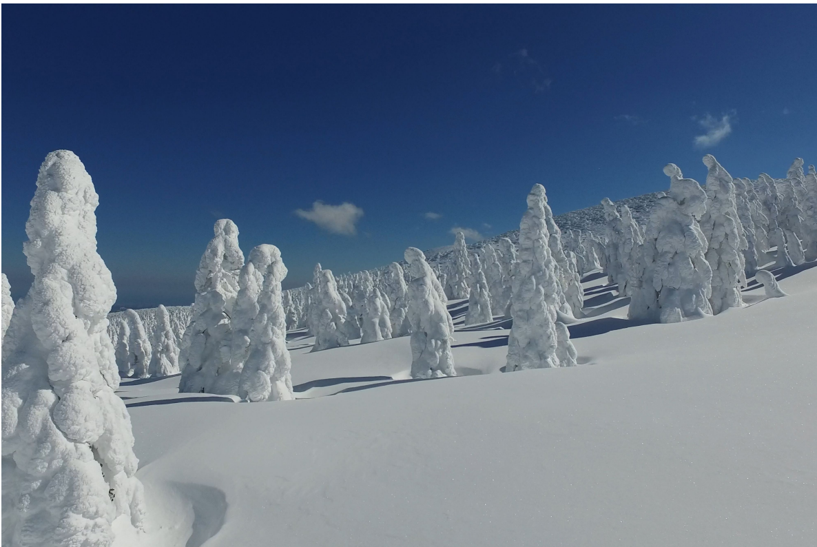
Photo: Yamagata: The natural sculptures of the Zao Snow Monster Festival

The charming city of Tokamachi is known across Japan for two reasons: as home to some of the most beautiful kimono designs in Japan and as the snowiest town on the main island of Honshu. The Tokamachi Snow Festival (February 15 – 17, 2020) celebrates the city's wintry wonders: it features magnificent ice sculptures and a kimono fashion show on what is recognized by the Guinness Book of World Records as the largest ice stage in the world. Alongside the 1,500-year history of traditional kimono, watch for the latest trends and cheer at the inauguration of the newly crowned kimono queen. In addition to awe-inspiring ice sculptures with magnificent illumination, this incredible snow carnival includes live concerts, Japanese folk dancing, fireworks and sweet warm sake.